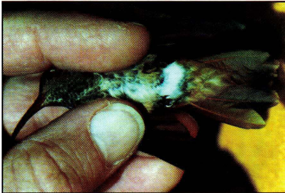
Figure 3. Ventral view, Buff-bellied hummingbird.

Like many hummingbird species, the Buff-bellied has been poorly studied, and there is little literature available for reference. To date, we do not know how to sex these birds in winter. This and the conflicting data available