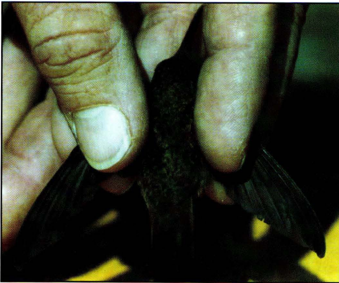
Figure 1. Dorsal view, Buff-bellied hummingbird.

adult bird, but the mostly black upper mandible implied an immature bird. The base of the upper mandible was a dull blackish red. The lower mandible was red except for a dusky-black tip. These confusing aging keys clearly indicate that this species needs study. We speculate that the red upper mandible in adults may well occur only if they are on their breeding grounds and in a heightened breeding state. The number of Buff-bellied hummingbirds that we encounter makes it difficult to draw conclusions from such a small sampling. However, this may be corrected soon through our studies and those of Professor Felipe Chavez-Ramirez of Texas A&M University.