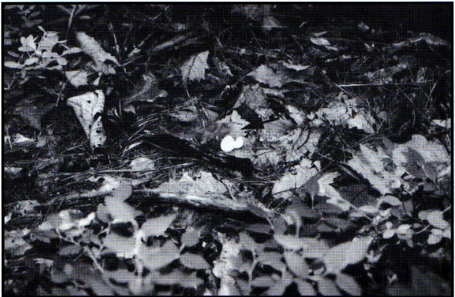
FIGURE 1. Eggshell and newly hatched Whip-poor-will chicks, 8 May 1998, Talladega National Forest, Calhoun County.

An examination of the area revealed the nest site to be on a fairly level, but gently sloping, rather open area near the end, or point, of a long ridge which dropped off steeply on both sides into deep hollows. The elevation of the ridge at the nest site was 1120 ft (341 m). The woods on the ridge consisted of mixed pine and deciduous trees including shortleaf ( Pinus echinata ) and loblolly ( P. taeda ) pines 25 to 35 feet (8-12 m) in height, chestnut oak ( Quercus prinus ), northern red oak ( Q. rubra ), white oak ( Q. alba ), hickories ( Carya spp.), black gum ( Nyssa sylvatica ), red maple ( Acer rubrum ), sourwood ( Oxydendrum arboreum ), and flowering dogwood ( Cornus florida ). The ground cover consisted of dense patches of blueberries ( Vaccinium spp.), except in the area of the nest, which was relatively open (Figure 1). The adjacent slopes and hollows consisted of open deciduous woods composed of the hardwood species noted above, plus tulip poplar ( Liriodendron tulipifera ), American beech ( Fagus grandifolia ), umbrella magnolia ( Magnolia tripetala ) and big leaf magnolia ( M. macrophylla ).