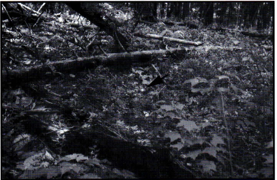
FIGURE 2. Whip-poor-will nesting site in Talladega National Forest, Calhoun County, 8 May 1998. An arrow marks the location of an eggshell and newly hatched chicks.

At first glance the site appeared much the same as numerous other places in the forest, but a closer look suggested otherwise. The nest was enclosed on one side by an old, weathered, fire-charred log, and on another by the dead top of a Virginia pine ( P. virginiana ), which had lost most of its limbs to fire and decay (Figure 2). These natural barriers probably served to steer or detour predators such as coyotes ( Canis latrans ), gray foxes ( Urocyon cinereoargenteus ), red foxes ( Vulpes fulva ), raccoons ( Procyon lotor ) and opossums ( Didelphis marsupialis ), around the nest. In addition to the protection provided by the log and tree top, the spot chosen to deposit the eggs was about an inch (2.5 cm) from a small limb, which appeared to serve as a barrier on the down slope side of the eggs (Figure 2).