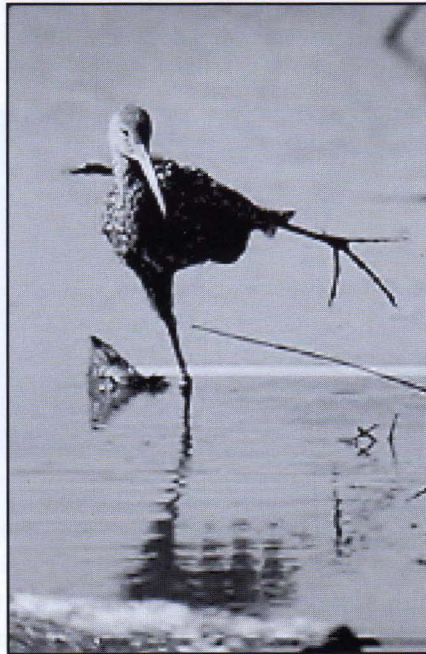
A stretch reveals the Limpkin's large feet, 11 November 2000.

Steve McConnell , 137 Longleaf Lane, Trussville, AL 35173; Jimmy Wells , 210 County Road 469, Cullman, AL, 35057