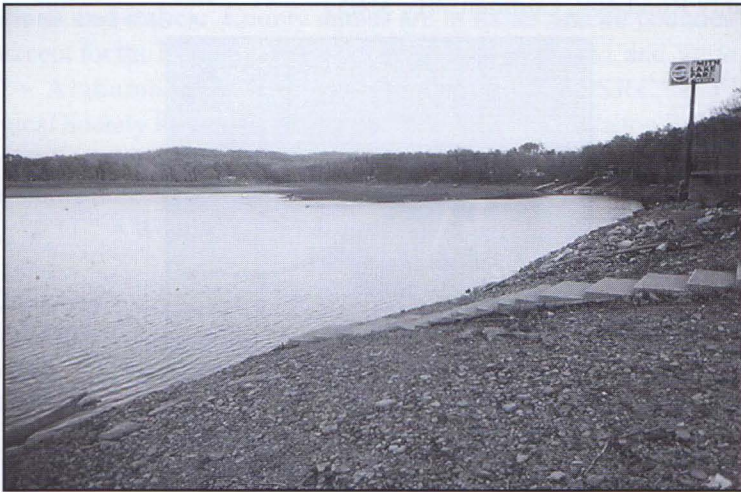
Figure 3. Mouth of Ryan Creek (Smith Lake) frequented by Limpkin, November 2000.